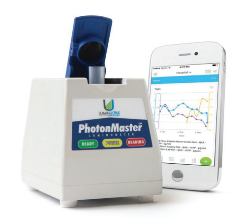
Figure 2. Luminometer and ATP Data Management

If there are applications that merit online or continuous ATP measurement, Hach can provide a unique solution for that as well. Please consult your local Hach representative.