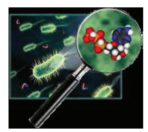
Figure 1. Adenosine Triphosphate (ATP)

ATP testing originated decades ago with the use of 1^{st} Generation swab-based devices. These systems effectively measure microbial content on surfaces in food and medical hygiene applications. They provide a qualitative "pass/fail" confirmation of surface cleanliness and are still effective tools in many Hazard Analysis Critical Control Point (HAACP) programs today. However, swab testing carries some drawbacks: